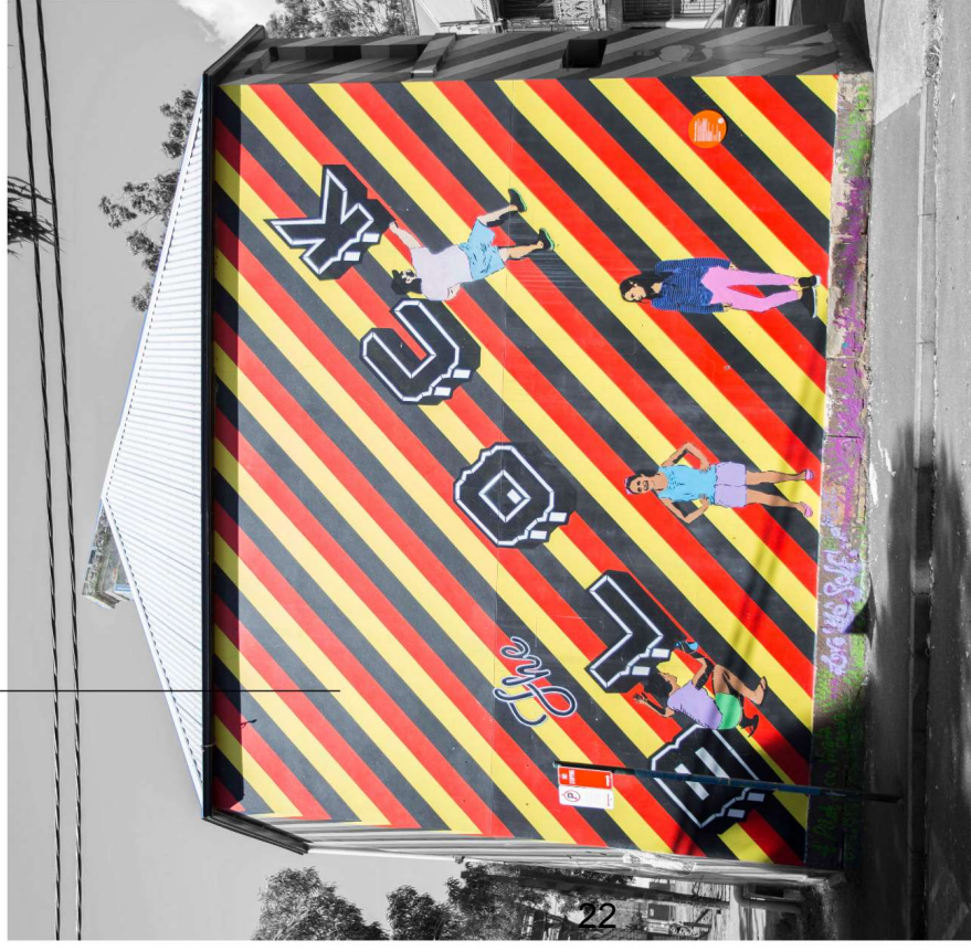
Hugo Street Elevation