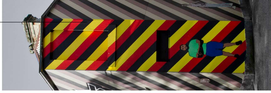
South west Elevation